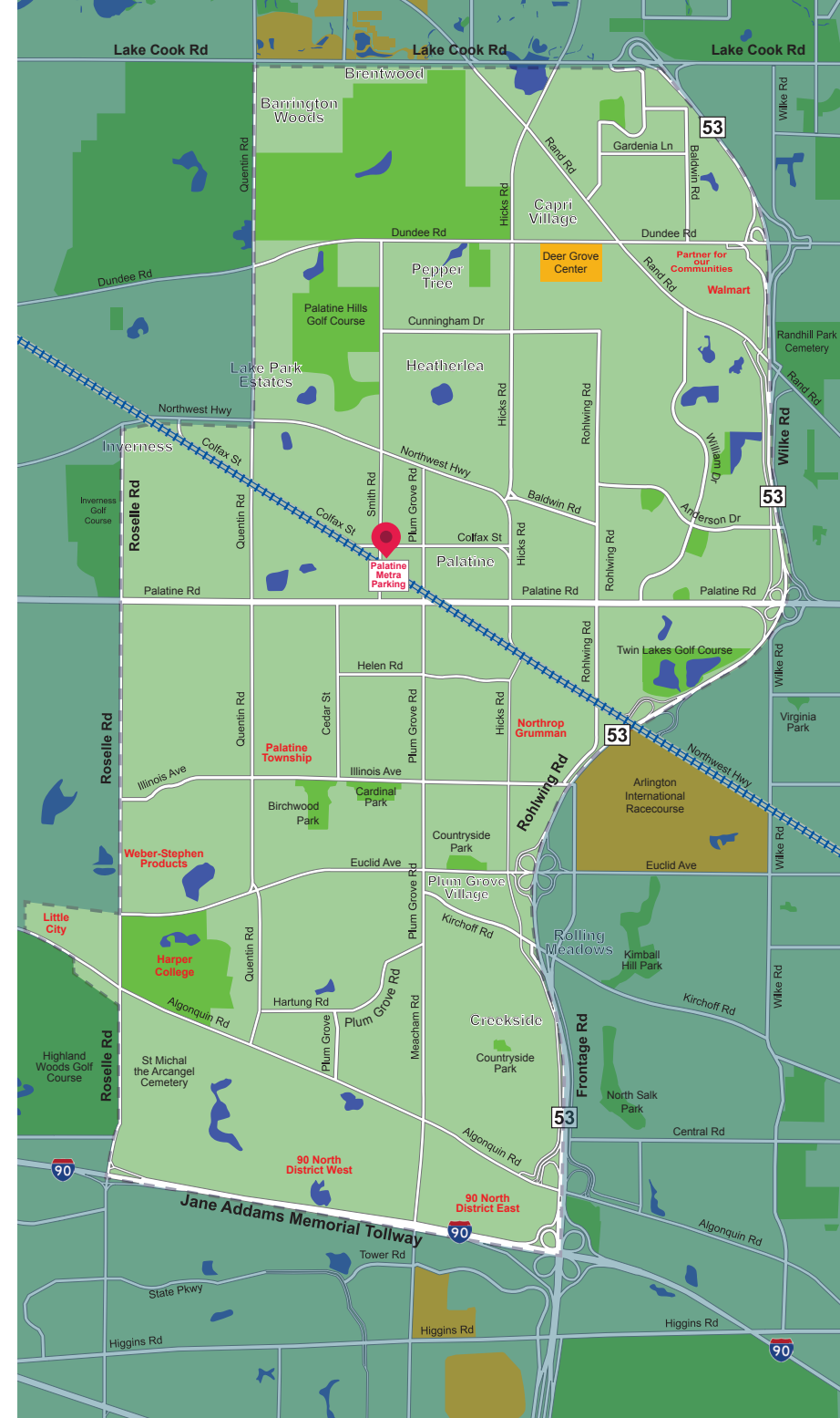
VanGo Palatine service area

The image above shows the exact location of the parking spaces in the Palatine Metra Station Lot B. Lot B is located north of the train tracks and just east of the train station building.